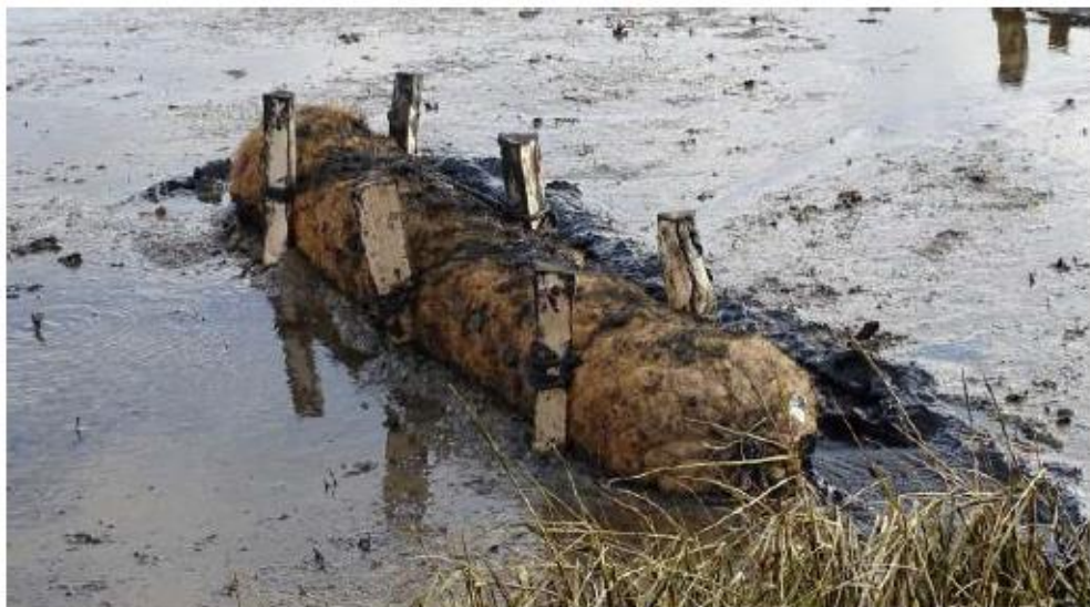
Figure 7-1 Typical Coir Roll installation

The proposed Coir rolls can be sourced in a range of dimensions, with a typical provider like Salix offering standard sizes of 3.0m long by 0.2m diameter or 3.0m long by 0.3m diameter, although any length is available by special order. Coir rolls are normally restrained in position through lashings to small timber stakes to prevent movement, similar to the setup indicated in Figure 7-1.